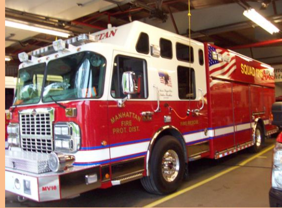
One of Manhattan's many fire trucks and equipment